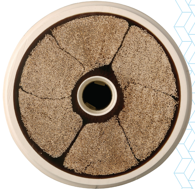
Hollow Fibre Membrane Element

Eta's team of experienced engineers offers a wide range of services and will assist with process evaluation and optimisation for new applications.